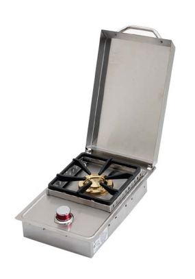
Related Links Cal Spas Website Cal Flame Website

Founded in 2000, Cal Flame is an award-winning hearth and barbecue manufacturer that offers innovative backyard solutions for every home and budget. Cal Flame lineup includes grills, drop-in accessories, customized outdoor kitchens, barbecue islands, custom barbecue carts, fireplaces and fire pits. For more information about Cal Flame, visit www.calflamebbq.com.